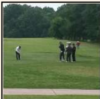
On the green at Black Bear Golf Club Delhi, LA