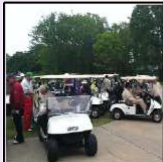
Ready to tee off at the Woodstock Golf Tournament