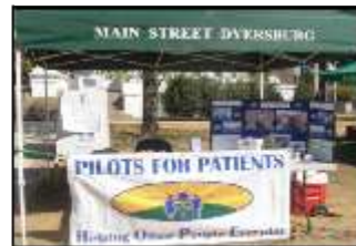
Pilots for Patients information tent, sharing what we do with the Dyersburg community.