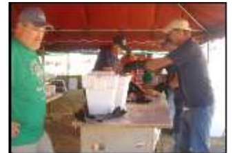
Busy chopping for those delicious pork sandwiches