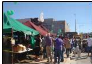
Patiently waiting in line for ribs, pork butts, and sandwiches..yum