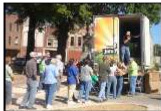
All these people were waiting in line to see our own Wayne Petrus...oh and to buy some of the 10,000 lbs of frozen sausage donated by Jimmy Dean.